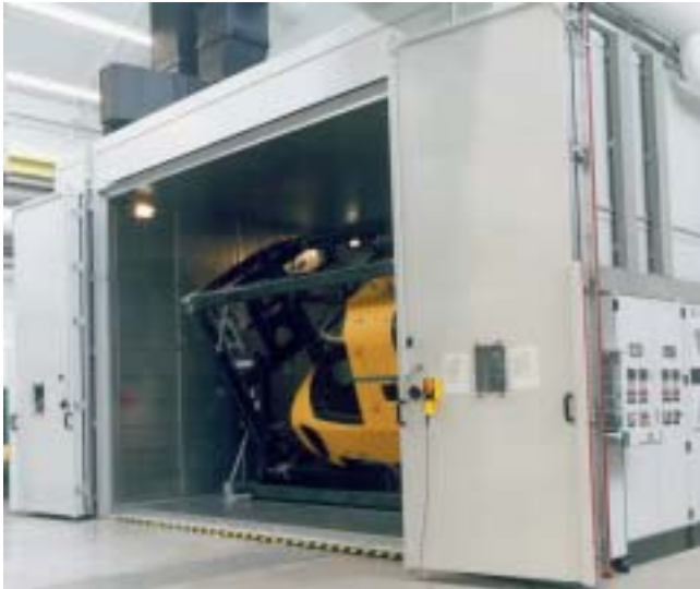
Recirculation air tempering oven with mobile rotating frame for CFRP helicopter cockpits