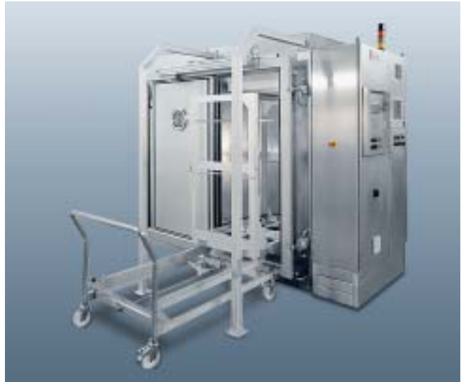
Vacuum heating and drying oven – Microwave-heated design available as option