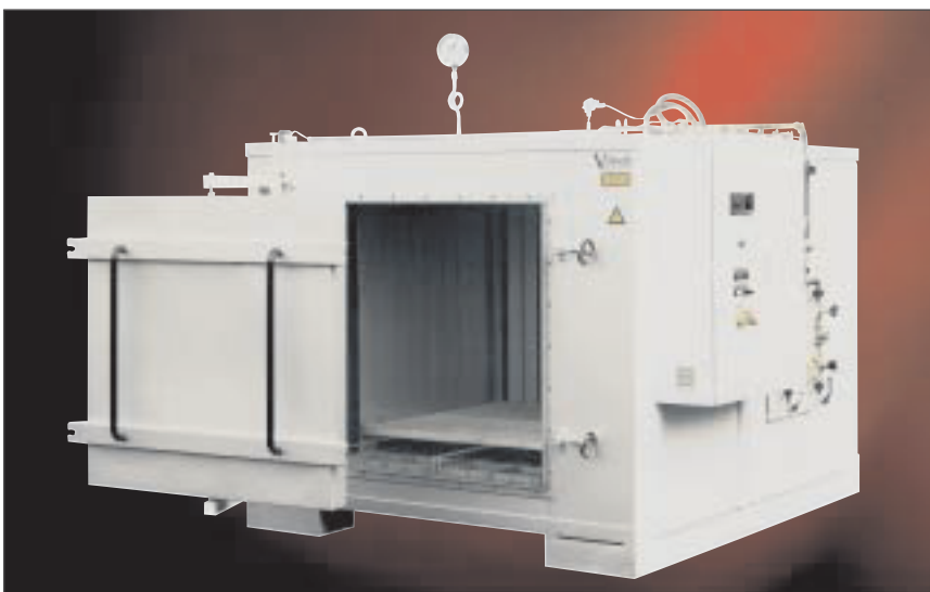
Tempering oven VAW 150/210/300 - 650 °C