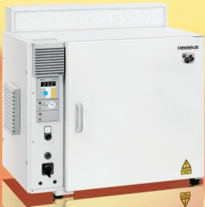
LUT 6050 F