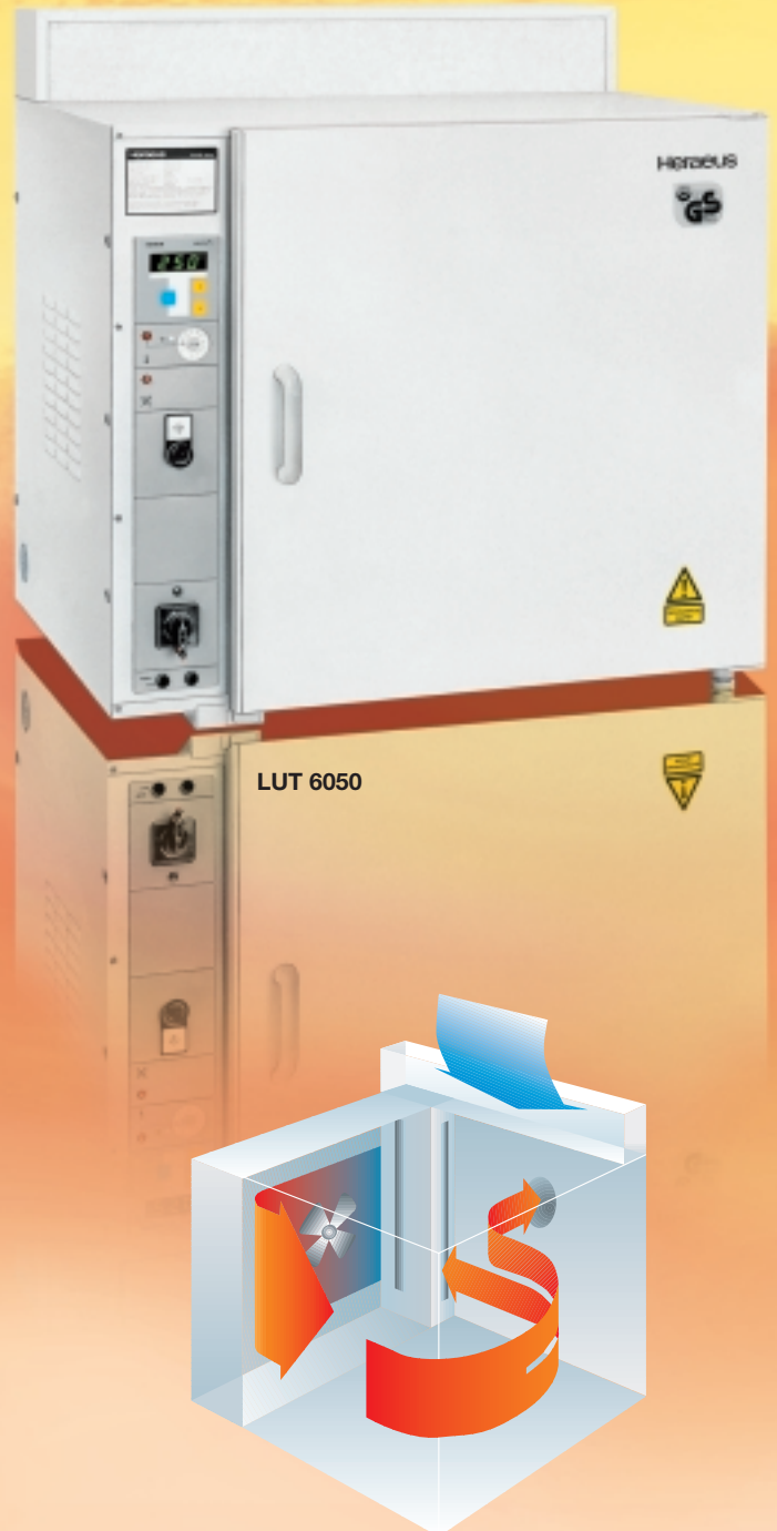
Avoiding the formation of “vapor pockets” by a well directed air supply system